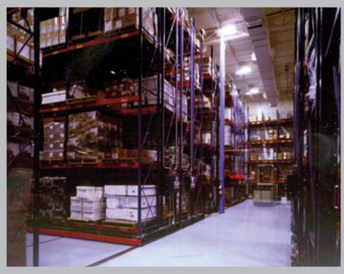
The high-density Aisle-Saver system along with the static pallet racks provides TSYS with 2,256 storage locations for pallets.