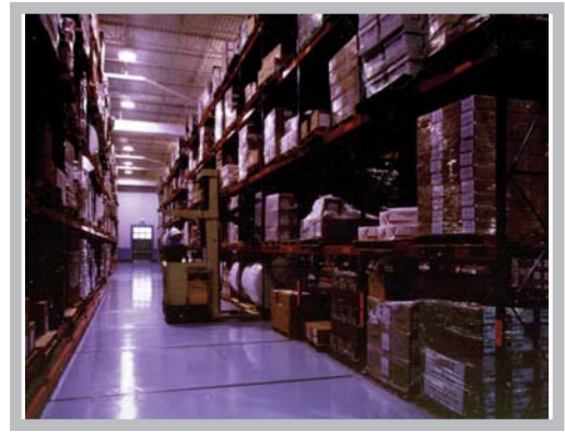
The Aisle-Saver system consists of eight movable carriages - four on each side with an aisle running down the middle.

The Aisle-Saver system consists of eight movable carriages - four on each side with an aisle running down the middle. There are also four fixed carriages - two on each side. The system provides TSYS with storage for 2,256 pallets - a total capacity of almost 4,000 tons of paper items.